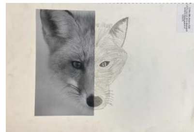
The Year 4 Team