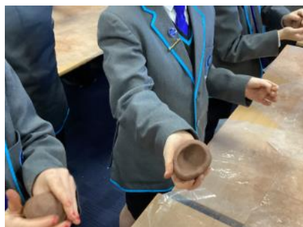
The Year 4 Team