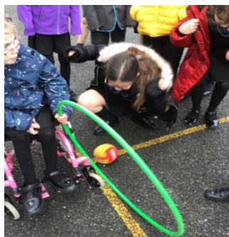
Year 5 Team

Thank you as ever for your support. If you ever have any queries about anything, do please catch us at the end of the day to discuss them, or send us an email.